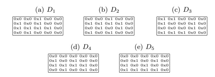
Table 1. The initial differences. Each entry represents a 64-bit word.

are satisfied. As long as the number of active S-boxes is relatively low (note that 32 is only 1/8 of the total 256 S-boxes), there is a high probability for the differential step.