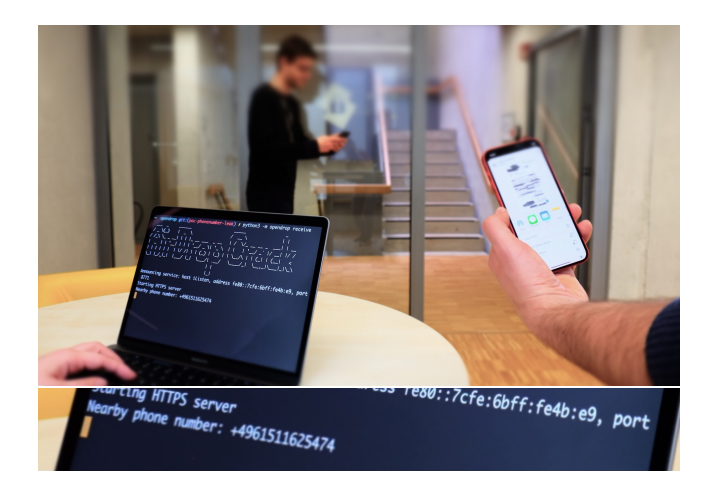
Figure 2: Test setup for demonstrating sender leakage. The iPhone user (right) opens the sharing pane on the device to share a document with the person in the background. The attacker (left) running "AirCollect" on a MacBook immediately sees the sender's phone number.

<sup>2</sup>Alternatively, we can also use a Linux-based machine such as a Raspberry Pi, but the setup then also requires running an open version of the AWDL protocol [10].