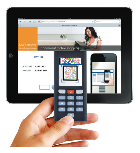
Fig. 6: OneSpan Digipass 770 authentication device.

In our protocol, the encrypted messages the server sends are in a form of a QR code, so the client can easily scan them from its computer's screen and transfer them to the device which verifies and decrypts the input messages, as explained in the protocol. However, to avoid limiting the protocol's application, we do not require the client's computer to be equipped with a scanner/camera. Therefore, the client needs to manually insert the message output of the device into its computer. Once again, to improve usability, it is desirable to reduce the size of each message that the device outputs. Our protocol allows truncating the verifier, as it is resistant to offline brute-force attacks, with a caveat. Truncating the verifier will create collisions such that for some values of the verifier there will be multiple PINs which are valid. Consequently, an adversary who has stolen a device has a better chance of guessing the PIN than the ideal case where the original message is used and its chance is negligible in the security parameter or the PIN's universe size. This security-usability trade-off is not specific to our protocol and exists in all hardware token-based multi-factor authentication protocols that do not assume clients' computers are equipped with a scanner and clients have to insert the device's messages into their computer.